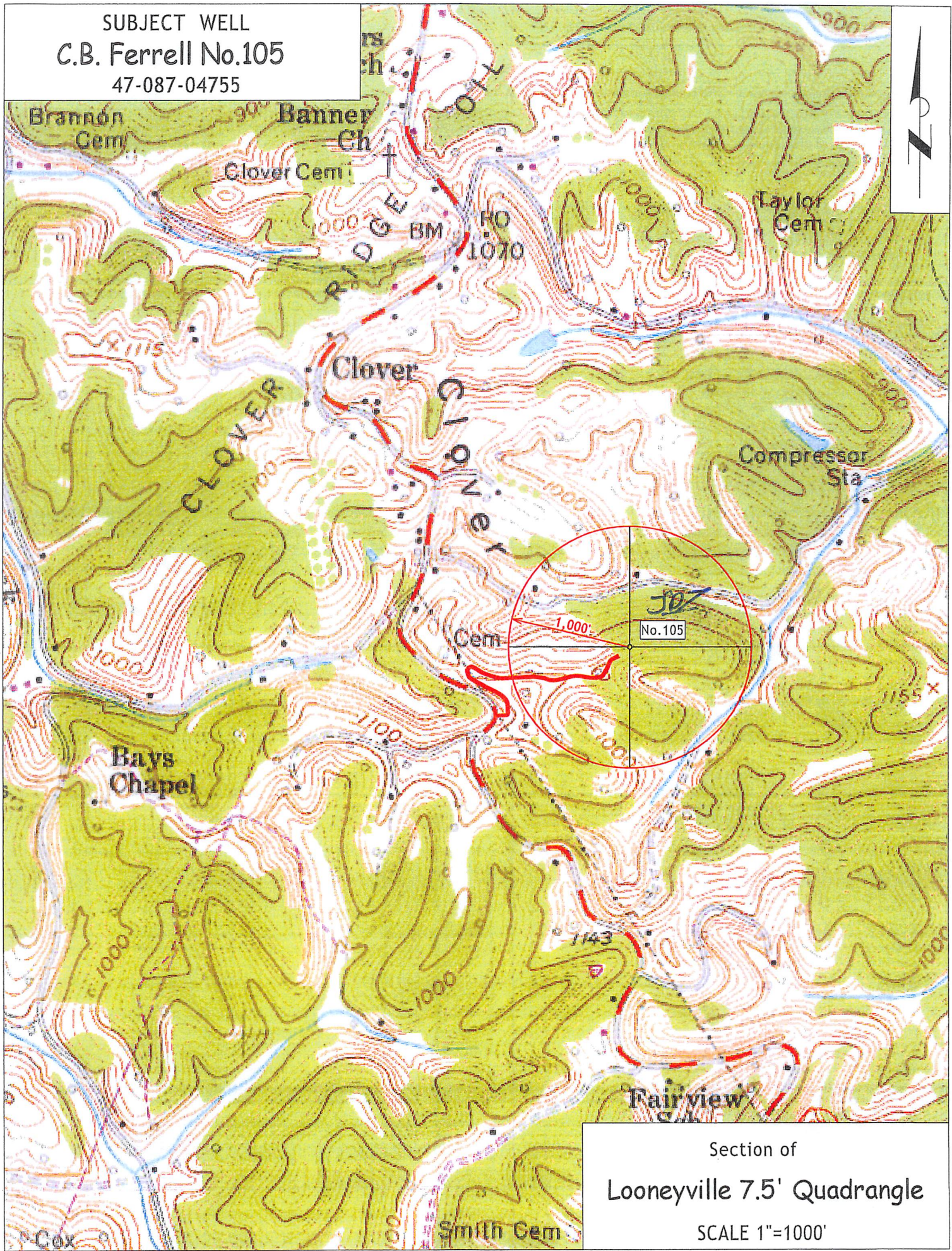
Section of Looneyville 7.5' Quadrangle SCALE 1"=1000'

SUBJECT WELL C.B. Ferrell No.105 47-087-04755