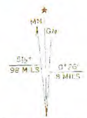
LTM GRID AND 1976 MAGNETIC NORTH OF CLINATION AT CENTER OF SHEET

RECEIVED Office of Oil and Gas SEP 20 2018 WV Department of Environmental Protection