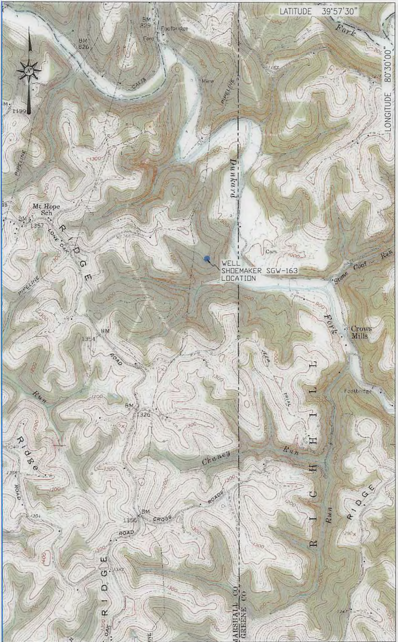
LOCATION MAP OCTOBER 3, 2014

Blue Mountain Inc. 11023 MASON DIXON HIGHWAY BURTON, WV 26562 PHONE: (304) 662-6486