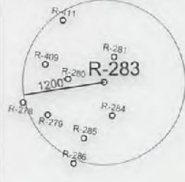
SURROUNDING WELLS WITHIN 1200' RADIUS