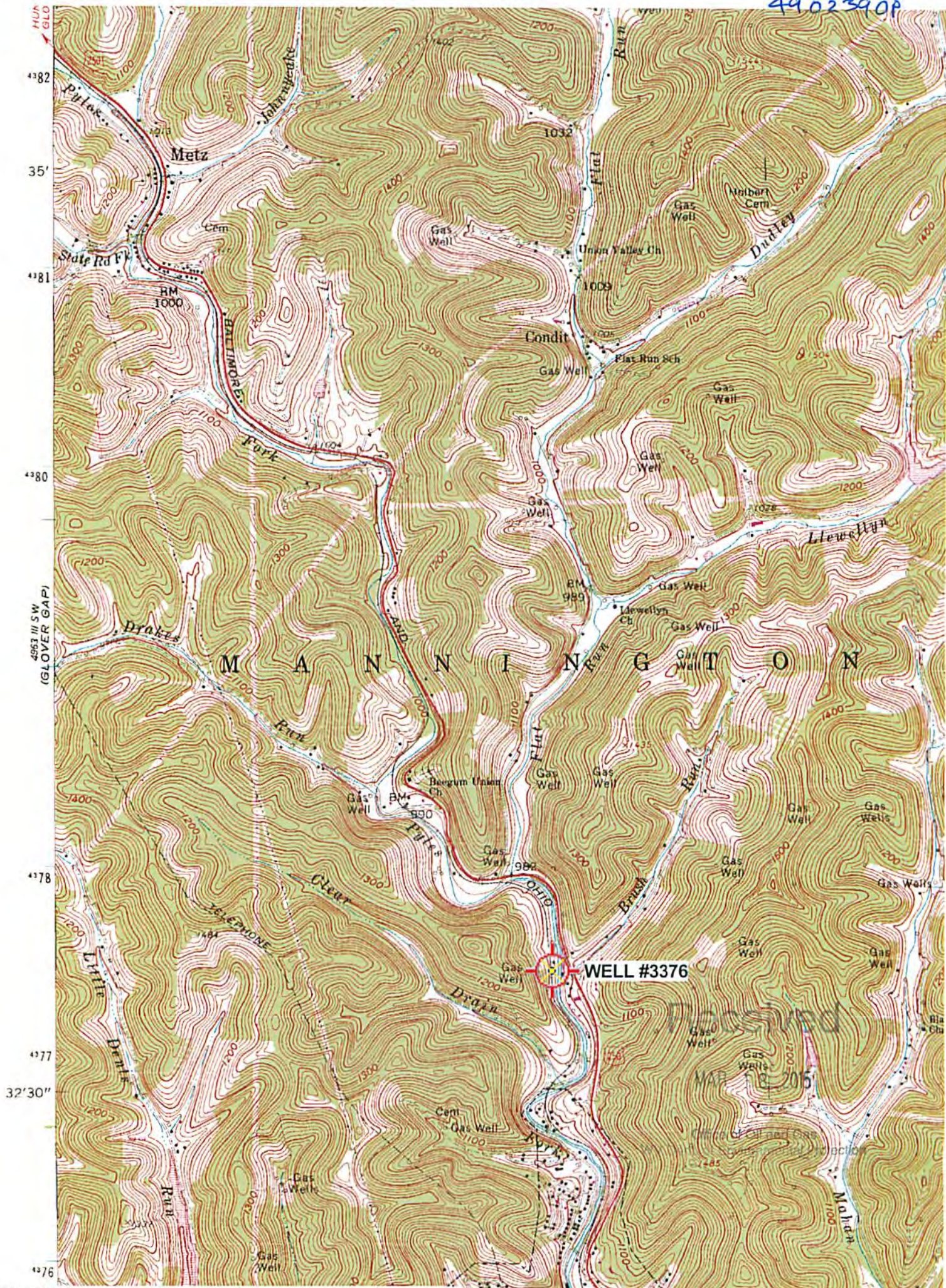
'Mannington; WV' Scale: 1" = 0.379Mi 610Mt 2,000Ft, 1 Mi = 2.640", 1 cm = 240Mt