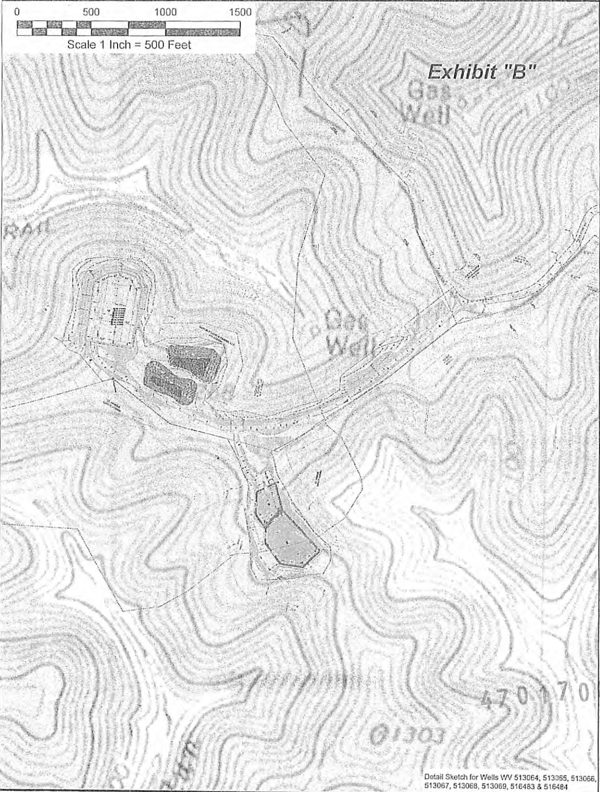
Detail Sketch for Wells WV 513064, 513065, 513066, 513067, 513068, 513069, 516483 & 516484